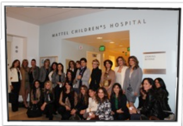
Third floor dedication to Looking Beyond at UCLA Mattel Hospital