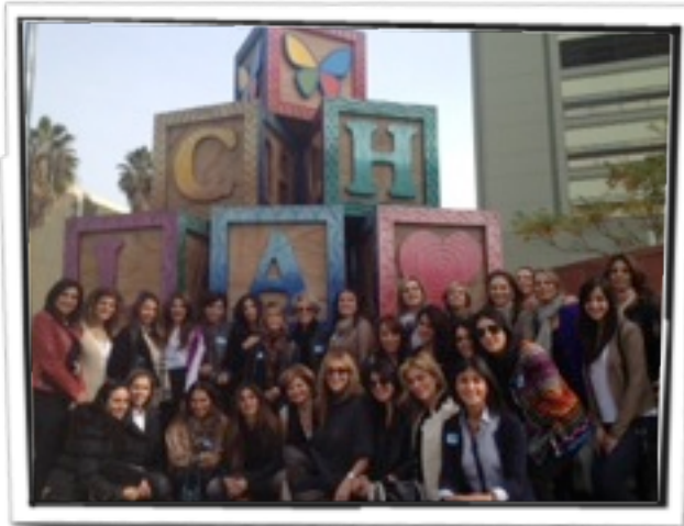
Los Angeles Children's Hospital Dedication to Looking Beyond room.